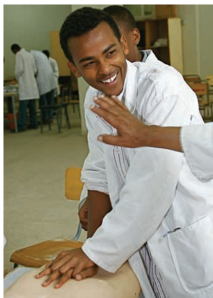
Health Officer student practices CPR at FIRST course