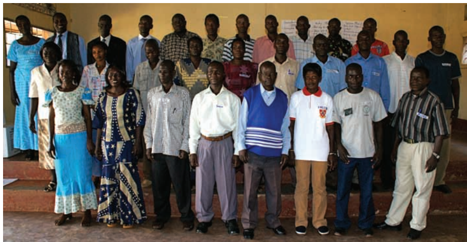
Teachers at Peace Building Instructors Workshop, Gulu, Uganda

The Fundamental Interventions, Referral and Safe Transfer (FIRST) course was piloted in Awassa in August. Content and organization were changed and re-tested in Jimma in September. 22 Health-officers trainees (18 men, 4 women) took the course in Awassa and 24 (16 men, 4 women) took the Jimma course. Designed to improve community level surgical and obstetrical care, FIRST is given to Health Officers, the first health professionals to see the patient, even in serious cases. CNIS focuses on this issue as too many low risk cases are being referred, while high-risk conditions are being delayed or not transferred safely to referral centers. CNIS has yet another course to improve surgery and obstetrics in African communities.