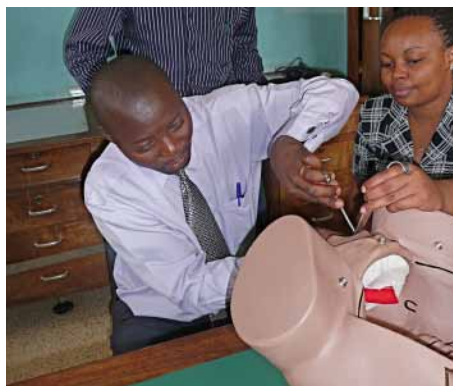
CNIS' Structured Operative Obstetrics Course held for the second time in Kampala, Uganda

during vaginal deliveries, use of vacuum extractor, sewing a cervical laceration, removing a retained placenta and plotting a Partogram. Following the three-day laboratory portion of the course, the students continued into the operating room, where each performed three incision closures and three complete c-sections, under the supervision of the faculty.