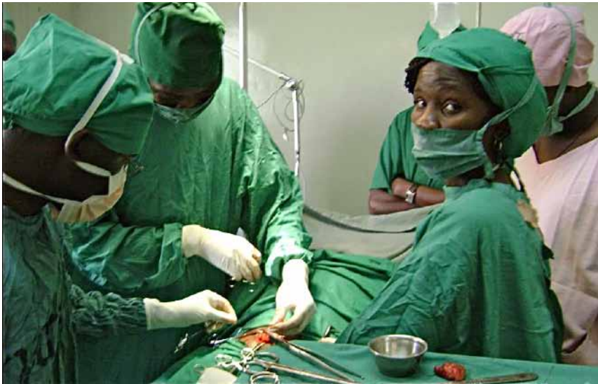
Hernia Repair Course in Mbarara, Uganda.