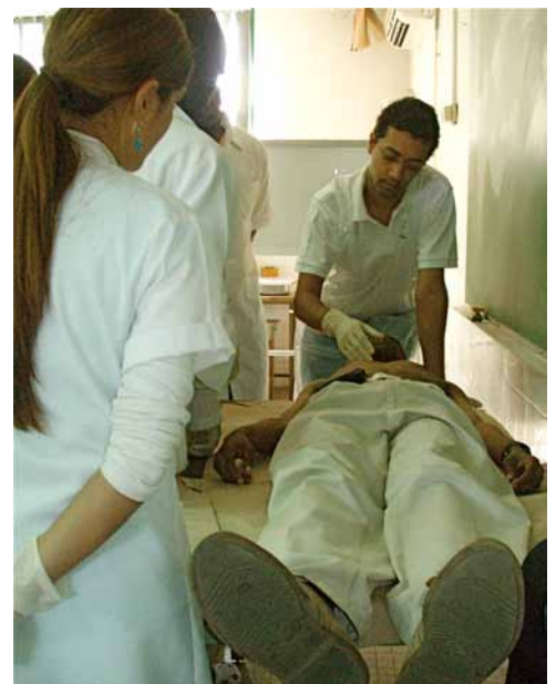
Airway Management Lesson, ESS course in Maputo