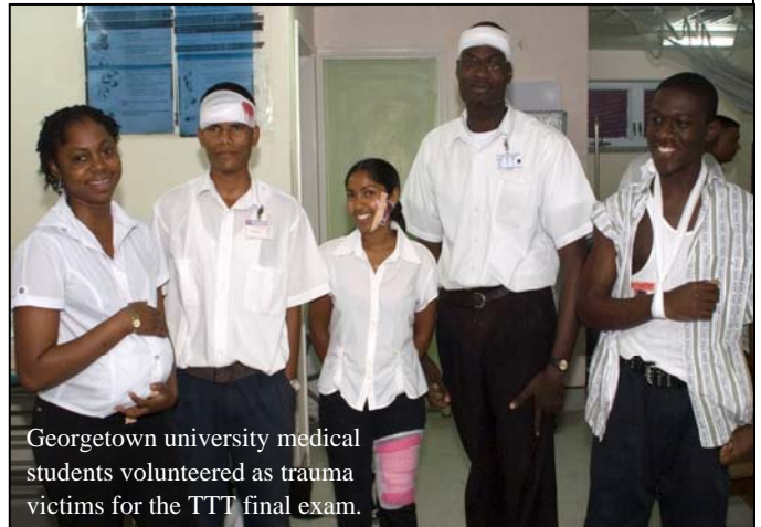
Georgetown university medical students volunteered as trauma victims for the TTT final exam.