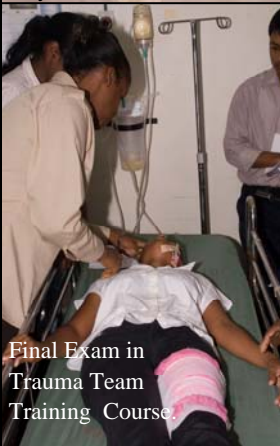
Final Exam in Trauma Team Training Course.