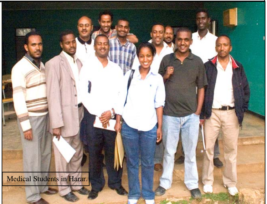
Medical Students in Harar.

The Innovation Project in Ethiopia continues with the financial support of CIDA and the Ethiopian North American Health Professionals Association (ENAHPA). ENAHPA has pledged 100,000 dollars to cost share CIDA's 200,000 and as you can see they have reached the 46% mark. The partnership between a Canadian NGO and the Ethiopian Diaspora is very unique and is much appreciated. This project involves activities in 6 universities. One objective was to provide the equipment and develop a faculty so that ESS can be conducted in the 3 emerging universities. This objective has been met in Awassa and Harar. In August an ESS instructors workshop was conducted at Haramaya University in eastern Ethiopia.